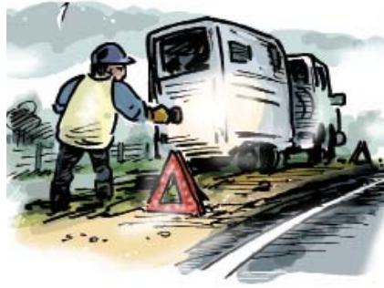
2. Make the scene safe