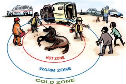
5. Stay calm, follow instructions