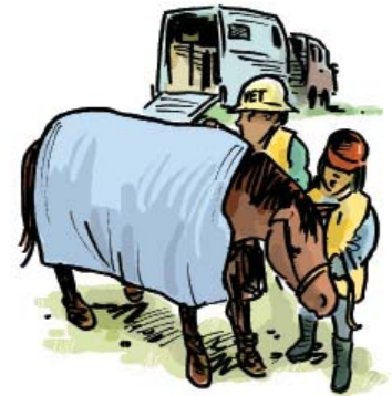
6. Organise after-care

In the case of an emergency, when the vehicle driver may not be available: