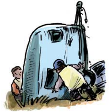
3. Peek in to check horses