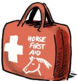
Horse first aid kit location: