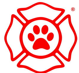
ANIMAL EVAC.NZ KARAREHE WHAKAWATEA