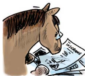
Site of horse info public can access