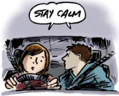
1. Stay Calm