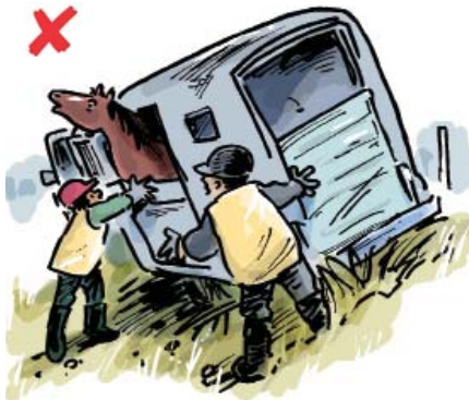
4. Do not open doors or windows